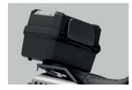
TOP BOX BACKREST

"Made of a sturdy and lightweight ballistic nylon, this 14 litre saddle bag enhances the tough appearance of the CL500. It can be attached / detached in aone step thanks to its three-point adapter sold separately. Equipped with a water-proof inner bag, easy to carry with its handle or its shoulder strap, this practical saddle bag is a must have for every day use. Allowable cargo load: 3.0 kg Required support 08L71-K3S-JAO solde separately."